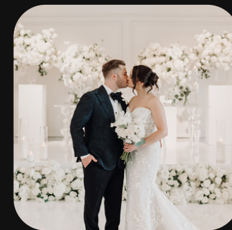
Photo planning should support the flow of the day. Choose locations that stay en route, consider a first look, and focus on capturing the images you'll truly want to revisit — not every possible combination.